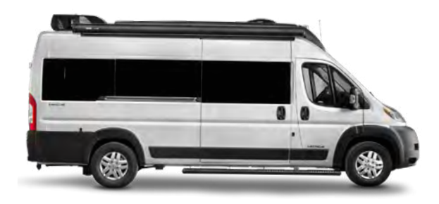
Bright Silver Metallic *Model shown with optional pop-top