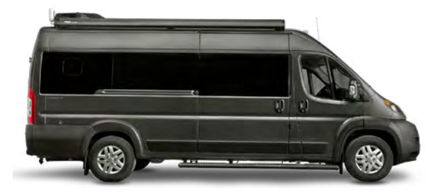
Granite Crystal Metallic